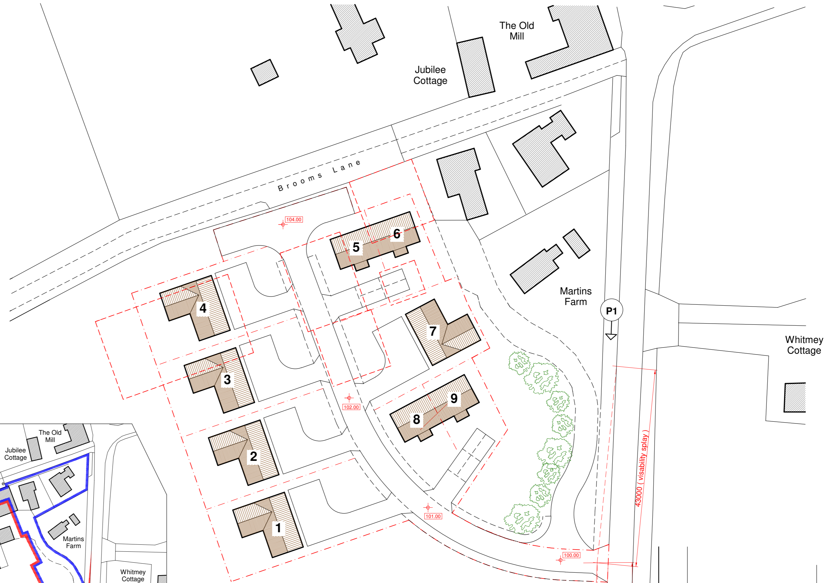
Site Plan ( 1:500 )